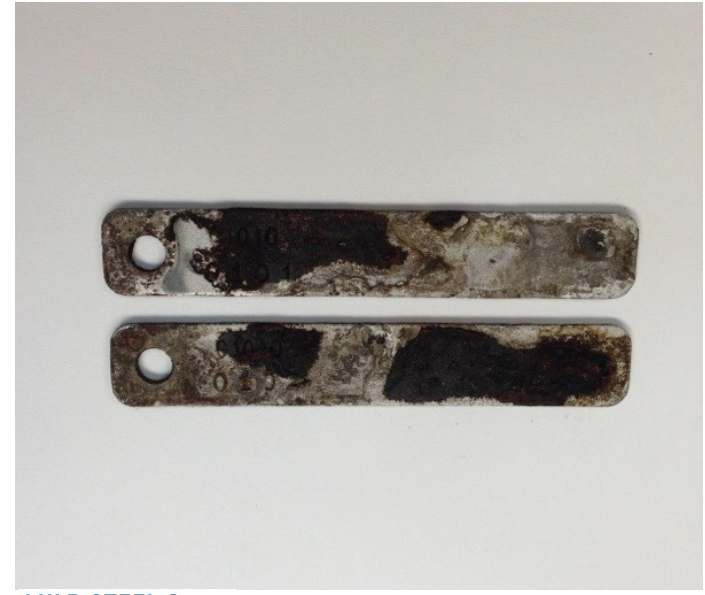
MILD STEEL C1010