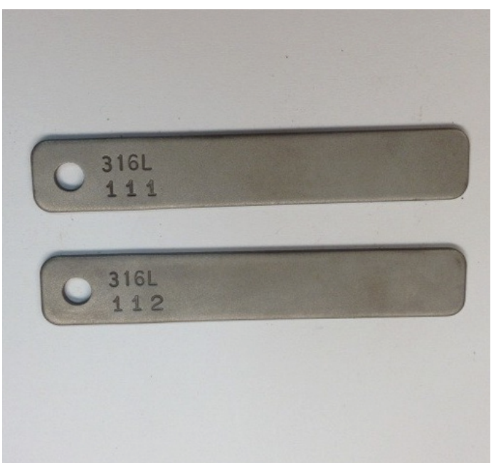
STAINLESS STEEL 316L