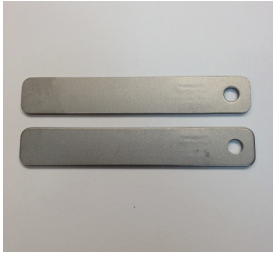
MILD STEEL C1010

FIGURE 1 Metal coupons prior to contact with the DBNPA test material. Metals tested were mild steel (C1010), stainless steel (316L), and zinc.