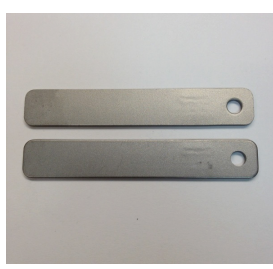
FIGURE 1 Metal coupons prior to contact with the DBNPA test material. Metals tested were mild steel (C1010), stainless steel (316L), and zinc.

Enviro Tech's Enviro Brom Tabs contain approximately 95% active DBNPA. Two metal coupons with a nominal size of 3'' \times \frac{1}{2}'' were obtained for each of mild steel (C1010), stainless steel (316L), and zinc. Each set of coupons was thoroughly washed with mild detergent and water, dried, and then rinsed with acetone to remove any residual oils. The exact dimensions of each coupon were measured using a caliper, and each coupon was weighed on an analytical balance. The three pairs of coupons were placed in three different pails each containing 5 gallons of Modesto city water at ambient temperature. The two coupons were place side-by-side in each bucket but were separated with a 3 mm plastic rod to prevent the two metal coupons from coming into contact. A 100 gram Enviro Brom Tab was placed directly on top of the coupons so both coupons were equally covered. Each of the three pails were covered and allowed to sit undisturbed for 30 days, the concentration of DBNPA in each pail being measured on a weekly basis using the Palin modification of the DPD method.