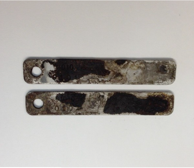
FIGURE 3 Final cleaned coupons after 30 day contact time with the DBNPA test material.