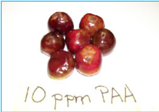
FIGURE 2: This picture illustrates a representative sample of the cherries rinsed with 10 ppm Perasan. The discoloration in the cherries represents soft, rotting areas.

Brown liquid was present in the bag where the cherries were stored, indicating the growth of yeast. Four cherries had cracked and it appeared visually that yeast had grown inside the crack. Mold was not visible, but the prior microbiological test results indicate it was present. The consistency of the cherries was just as soft as the control group.