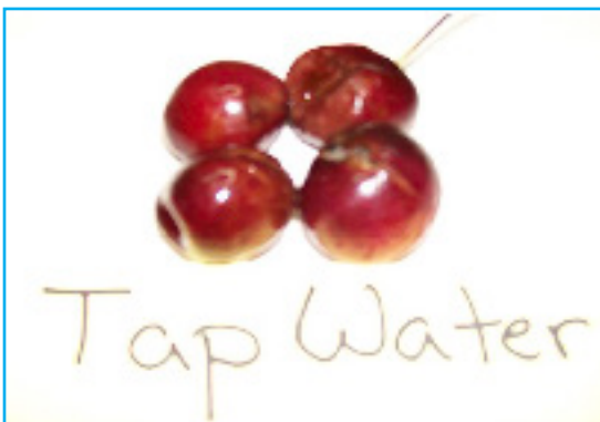
FIGURE 1: In the picture above four cherries were selected from the control group to illustrate the aged appearance of untreated cherries after two months. Some cherries split open, others had developed rotten areas, and many cherries appeared unchanged.

Brown liquid was present in the bag where the cherries were stored, indicating the growth of yeast. A few of the cherries that had split had mold present in the cracks. The consistency of the cherries was very soft with a mild smell of fermentation.