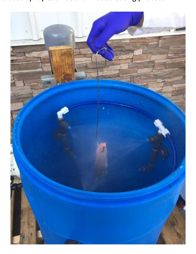
<u>Imagine 1</u> shows the simulated spray cabinet and meat treating process.

After the meat strips were rinsed with the rinsed with the 100 mL of D/E Neutralizing Broth, the strips were rinse with tap water for 20 seconds and allowed to sit undisturbed for 20 minutes. The color and texture of the untreated, water treated, and 300 ppm PAA treated samples were compared. There appeared to be no difference in the different meat samples.