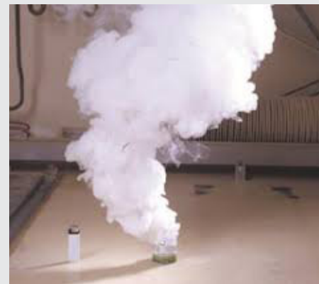
Figure 2. Smoke Generator (SG)