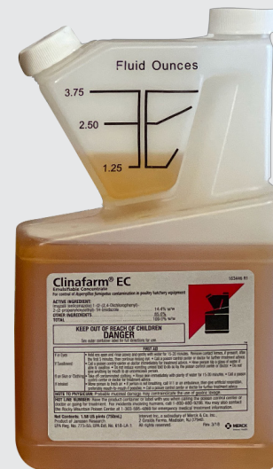
Figure 1. Liquid Emulsifiable Concentrate (EC)

Recognized expert in decontamination, disinfection and detoxification of food, air, water, the gastrointestinal lumen, and surfaces.