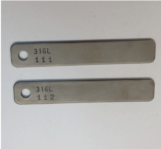
STAINLESS STEEL 316L