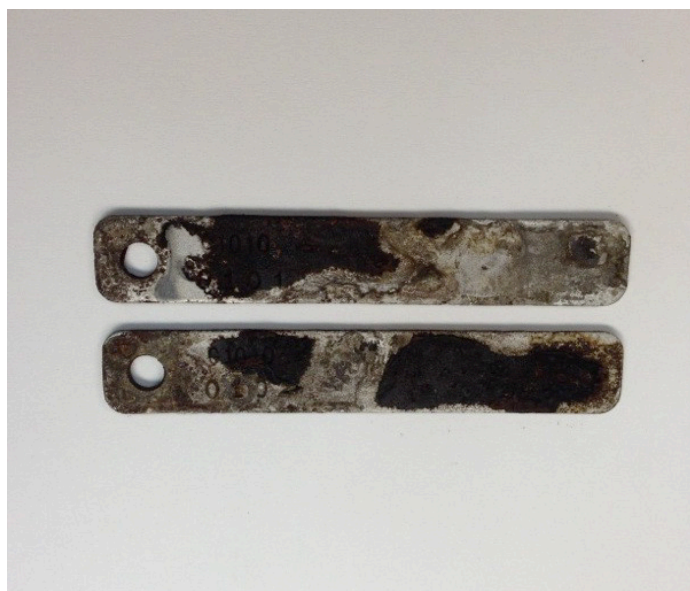
MILD STEEL C1010