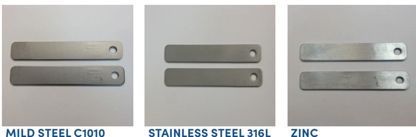
FIGURE 1 Metal coupons prior to contact with the DBNPA test material. Metals tested were mild steel (C1010), stainless steel (316L), and zinc.

Enviro Tech's Enviro Brom Tabs contain approximately 95% active DBNPA. Two metal coupons with a nominal size of 3" x 1/2" were obtained for each of mild steel (C1010), stainless steel (316L), and zinc. Each set of coupons was thoroughly washed with mild detergent and water, dried, and then rinsed with acetone to remove any residual oils. The exact dimensions of each coupon were measured using a caliper, and each coupon was weighed on an analytical balance. The three pairs of coupons were placed in three different pails each containing 5 gallons of Modesto city water at ambient temperature. The two coupons were placed side-by-side in each bucket but were separated with a 3 mm plastic rod to prevent the two metal coupons from coming into contact. A 100 gram Enviro Brom Tab was placed directly on top of the coupons so both coupons were equally covered. Each of the three pails were covered and allowed to sit undisturbed for 30 days, the concentration of DBNPA in each pail being measured on a weekly basis using the Palin modification of the DPD method.